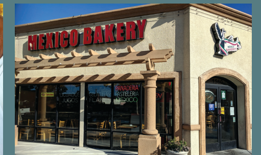
Melchor's Family Bakery in San Jose, CA