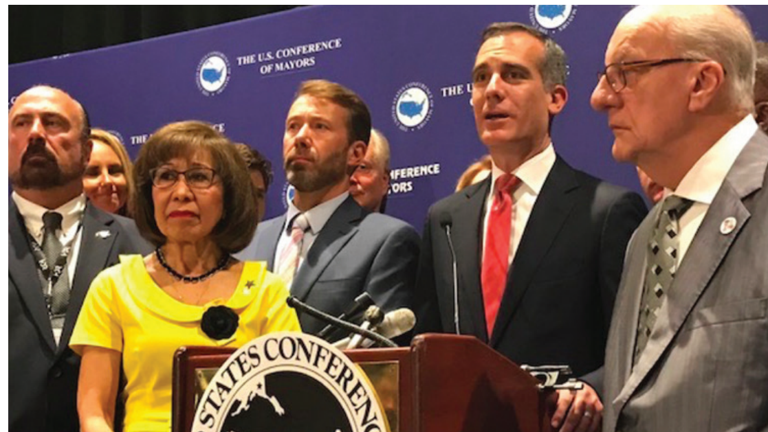
Mayor Eric Garcetti of Los Angeles announcing the C4C "America is Home" Initiative at the U.S. Conference of Mayors in Boston, June 2018

Lawful Permanent Residents were assisted with financial empowerment services lead by C4C cities and counties