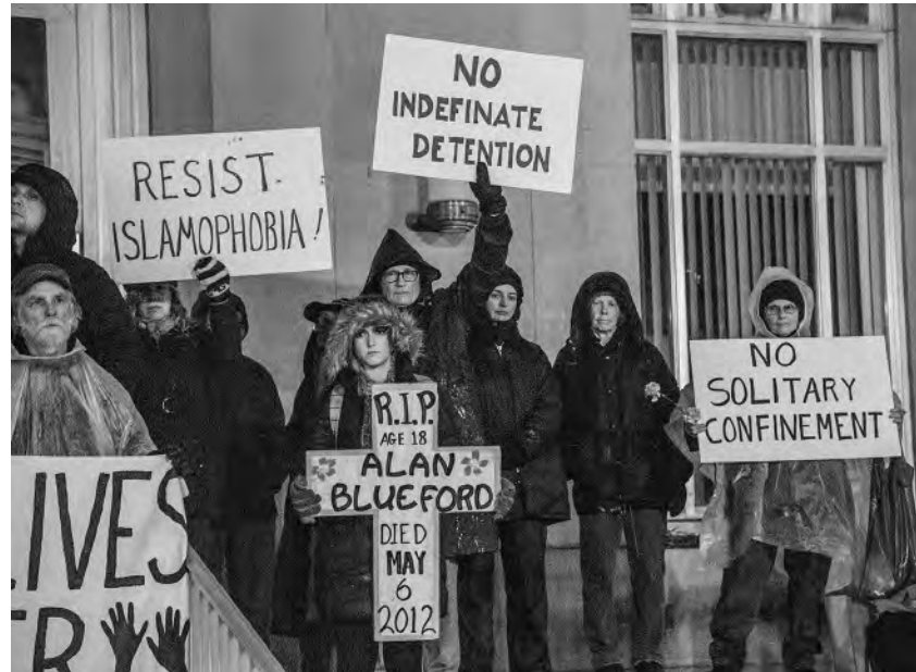
Protest on January 12, 2015, Washington, DC.