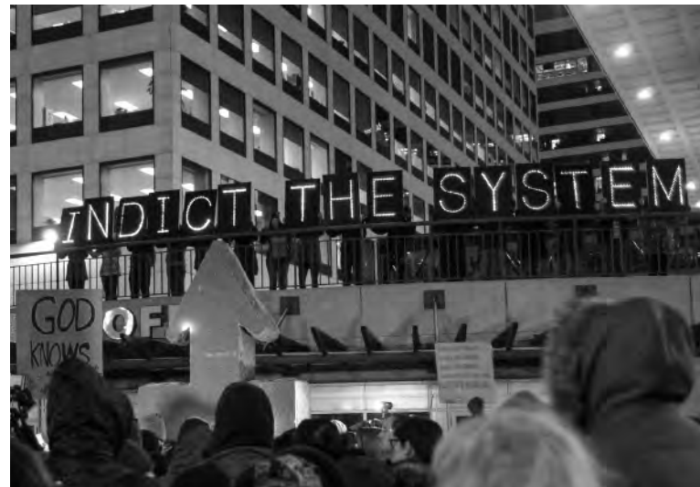
Protest in Milwaukee, WI on November 25, 2014.

Bench warrants are used throughout the country when someone misses a court date. The practice is especially devastating for low-income individuals who are unable to pay fines and has a disproportionate impact on Black and Brown people, who are often targeted by police. In recognition of the discriminatory and crippling impact of bench warrants, many community organizations support the adoption of a range of policies to mitigate the effect on community members. These policies include: allowing individuals to attain background checks even with an outstanding bench warrant, instituting regular times where people can appear in court so that individuals do not spend significant time in jail waiting to appear before a judge over a bench warrant, eliminating bench warrants all together, and ensuring that individuals are not jailed multiple times for the same ticket or offense. A number of jurisdictions, from Baton Rouge to Atlanta, have offered amnesty for existing bench warrants. However, these amnesty programs