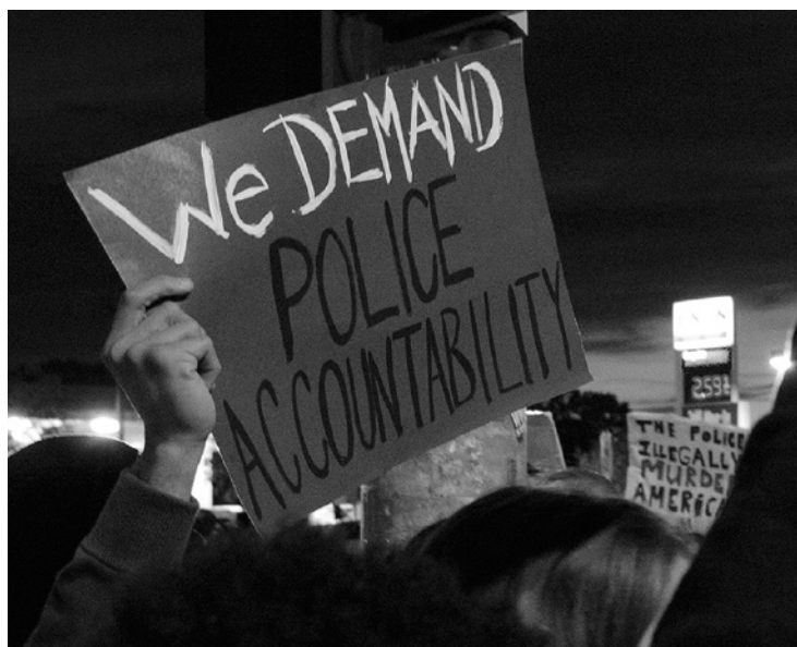
Protest in Memphis, TN, November 24, 2013.

Here is a template of a Mayoral Pledge to end police violence: www.policylink.org/node/29911 .