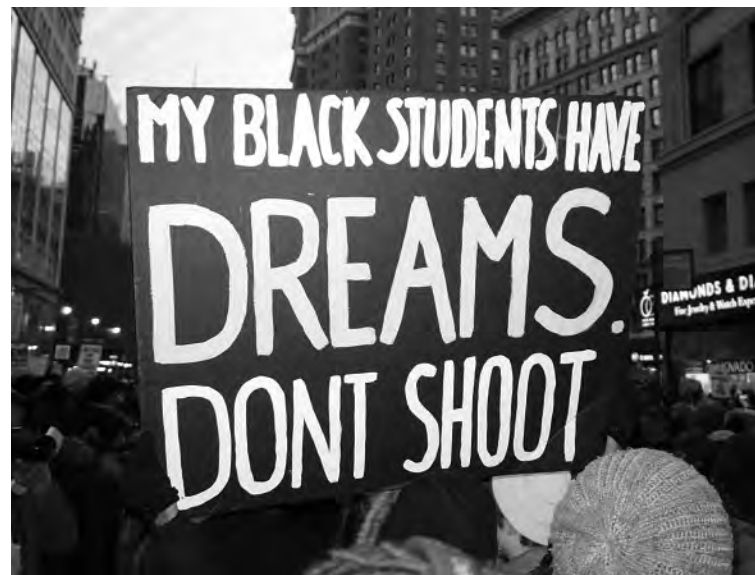
Millions March NYC, December 13, 2014.

As a result of the onslaught of new “crimes,” law enforcement priorities have shifted from the investigation of violent crimes to an emphasis on administrative and regulatory violations, including things like public consumption of alcohol, spitting or even wearing sagging pants. It is estimated that the average officer spends 90% of their time dealing with minor infractions that violate local administrative codes and only 10% of their time dealing with violent crimes. The new laws broadened officer discretion and increased targeting of low-income Black and Latina/o communities. More than 80% of those ticketed in New York City for low-level offenses are Black or Latina/o people. Similar discrepancies exist in