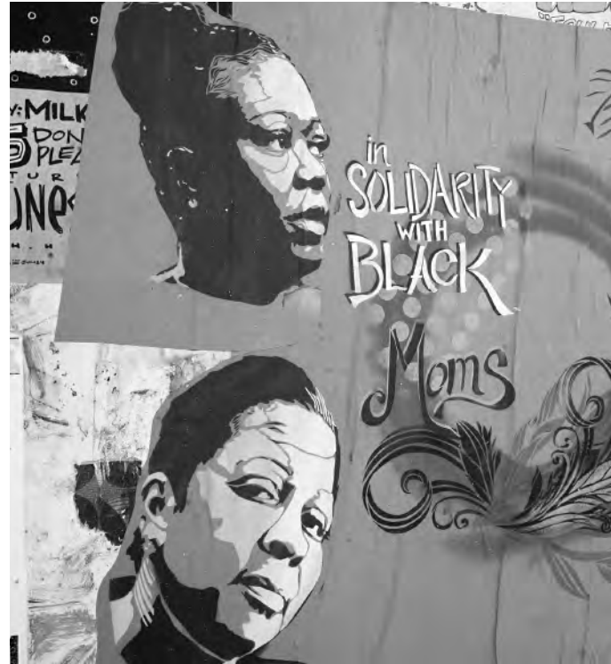
Street art in Washington, DC in December 2014.