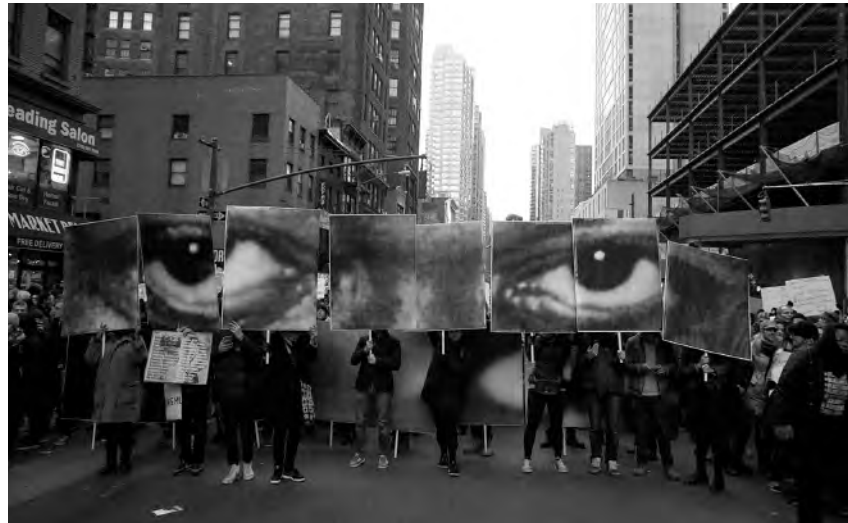
Signs showing the eyes of Eric Garner held during Millions March, NYC, December 13, 2014.

More than 100 jurisdictions across the country have some type of civilian oversight commission or board, but few communities feel they have true control over their police departments. In recognition of the reality that community oversight is fundamental to the legitimacy of local law enforcement, many communities have renewed their call for meaningful community oversight. Traditionally, civilian or community oversight boards provide communities a say in the disciplining of officers accused of misconduct against community members. However, a number of jurisdictions, including Seattle, San Francisco, St. Louis and Newark, have started to advocate for review boards with a wider scope—including the power to investigate departmental practices, impact hiring decisions, and help identify policing priorities. Seattle’s Community Police Commission includes both the power to investigate individual cases and address systematic issues. Whatever the scope of the commission or board, community oversight is only meaningful if boards are independent, actually represent impacted communities, have adequate funding, and have full investigatory and disciplinary power.