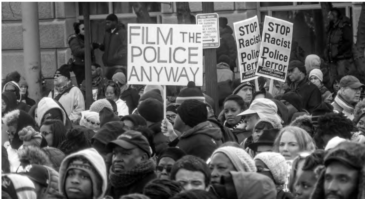
National March against Police Violence, Washington, DC, December 13, 2014.