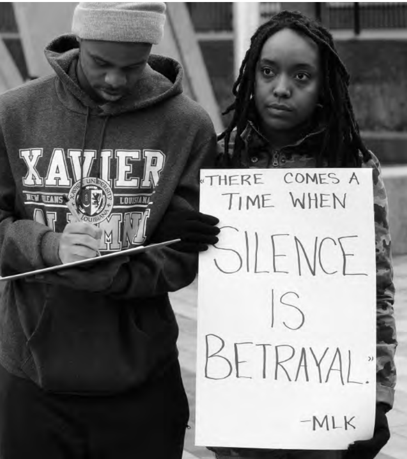
Reclaim MLK Day rally in Silver Springs, MD on January 24, 2015.

For most, the need for policy change is nested within a broader vision, of a government and society that invests in health, education, and wealth—not just criminalization and incarceration. Many communities are demanding a re-evaluation of our investment priorities.