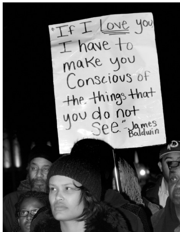
Protest against the failure to indict Officer Darren Wilson, Washington, DC, on November 25, 2014.

For decades in New York City, discriminatory profiling was the cornerstone of the New York Police Department's (NYPD) stop-and-frisk practices. Overwhelming numbers of Black and Brown residents were stopped and harassed with no cause. Although young Black and Latino men made up only 4.7% of New York City's population they accounted for 41.6% of those stopped in 2011. Racial disparity rates for women stopped by the NYPD equaled that of men—on average over 80% of women stopped by the NYPD were Black or Brown. Additionally, according to researchers at CUNY Graduate Center, LBGQT youth were more likely to report negative interactions with police than their heterosexual peers, and more than twice as likely to report sexual harassment by police.