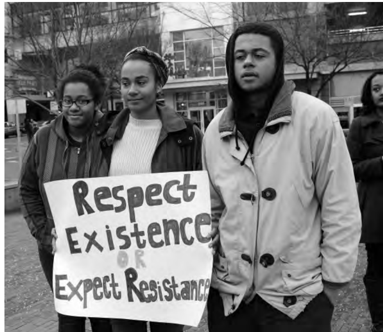
Reclaim MLK Day rally in Silver Springs, MD on January 24, 2015.

In order to ensure that internal policies and trainings effectively improve the safety of communities—specifically youth, Black and Brown, and LGBTQ communities—trainings should be developed in partnership with community-based organizations working directly with individuals affected by discriminatory and abusive policing practices. Police departments should not be directly funded for training; state and local funding should be earmarked for community-based trainers selected through an application process with public input.