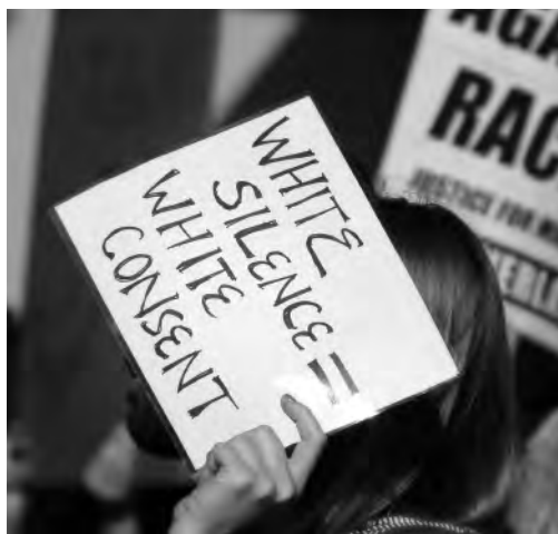
Protest in Los Angeles, CA on December 13, 2014.

The Seattle Community Police Commission provides another model. Rather than being headed by a single person, who may be vulnerable to political pressure or just not be effective, the Community