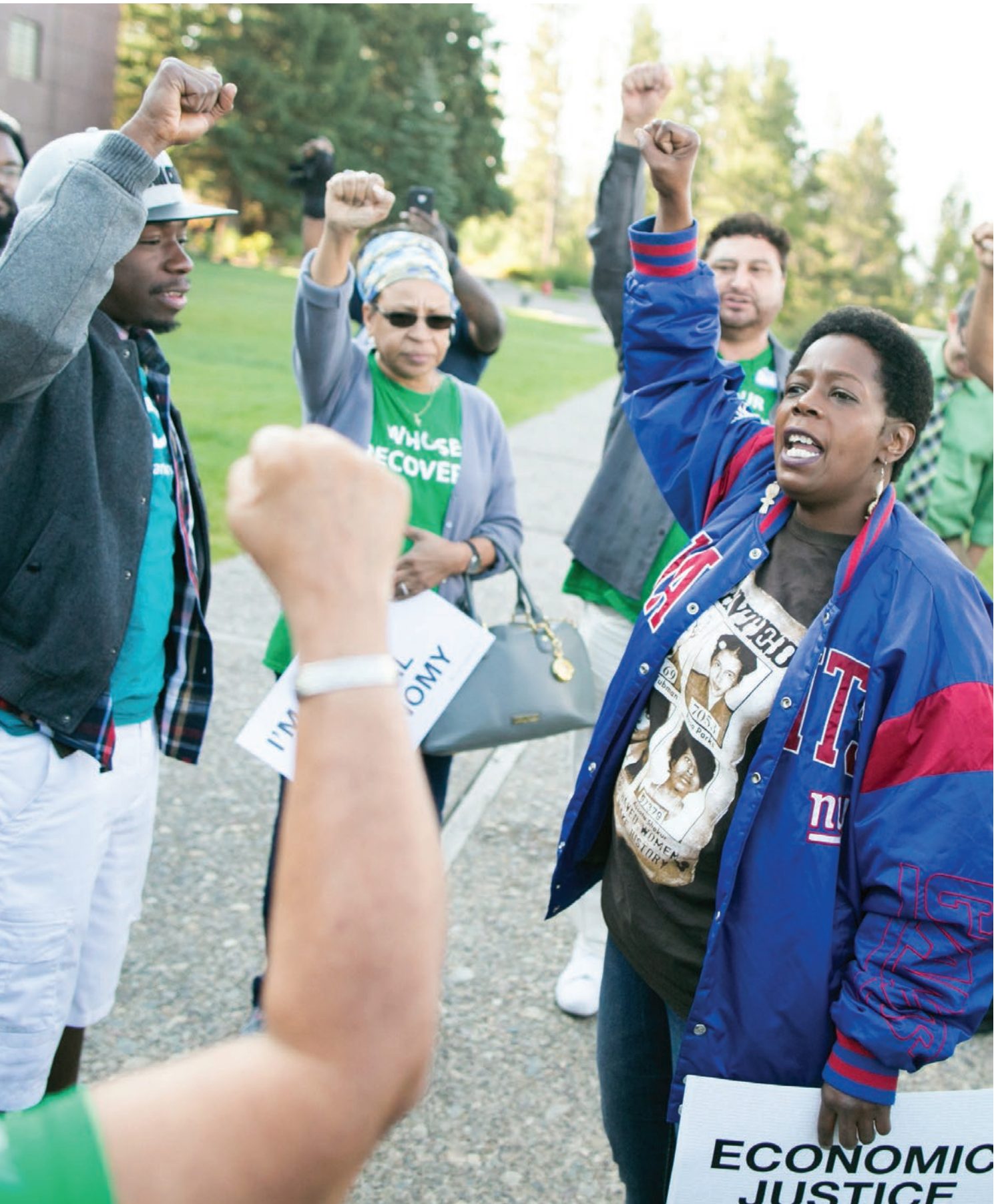
Fed Up activists in Jackson Hole, Wyoming calling for Full Employment during the Fed's Annual conference, August 25, 2015.