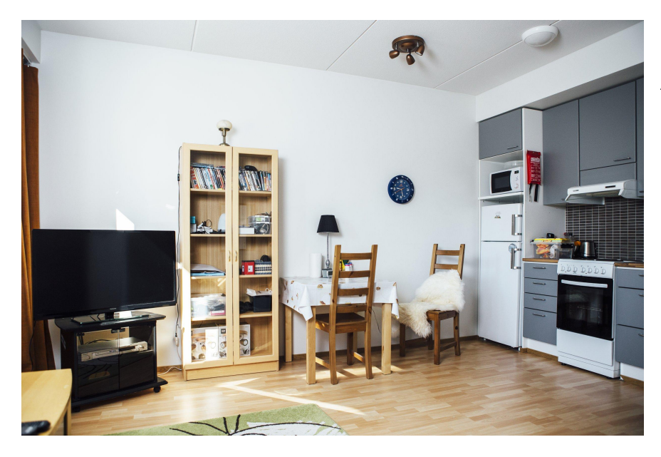
An apartment in Väinölä, a social housing development for formerly unhoused people in Espoo, Finland.