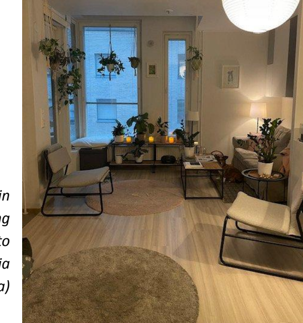
Vesala's apartment in the social housing project.