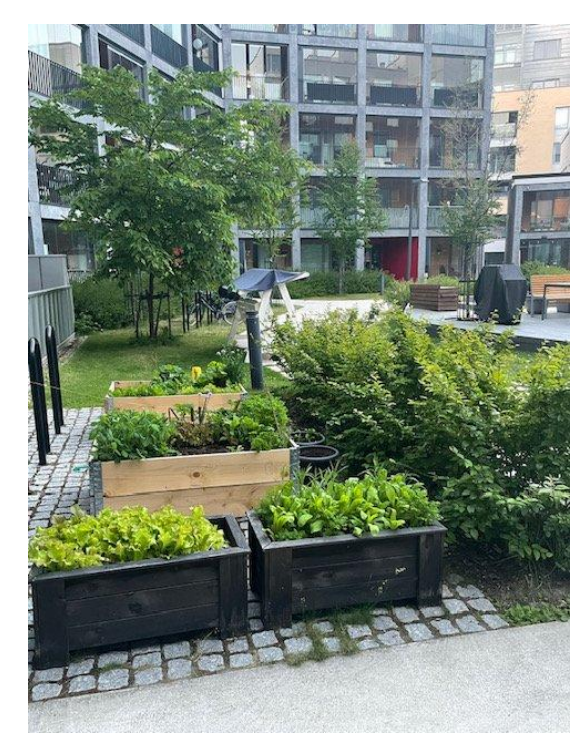
The "winter garden."

"I think we have a pretty good system here in Finland now... It gives many people the chance to live in the city-center with more affordable apartments."