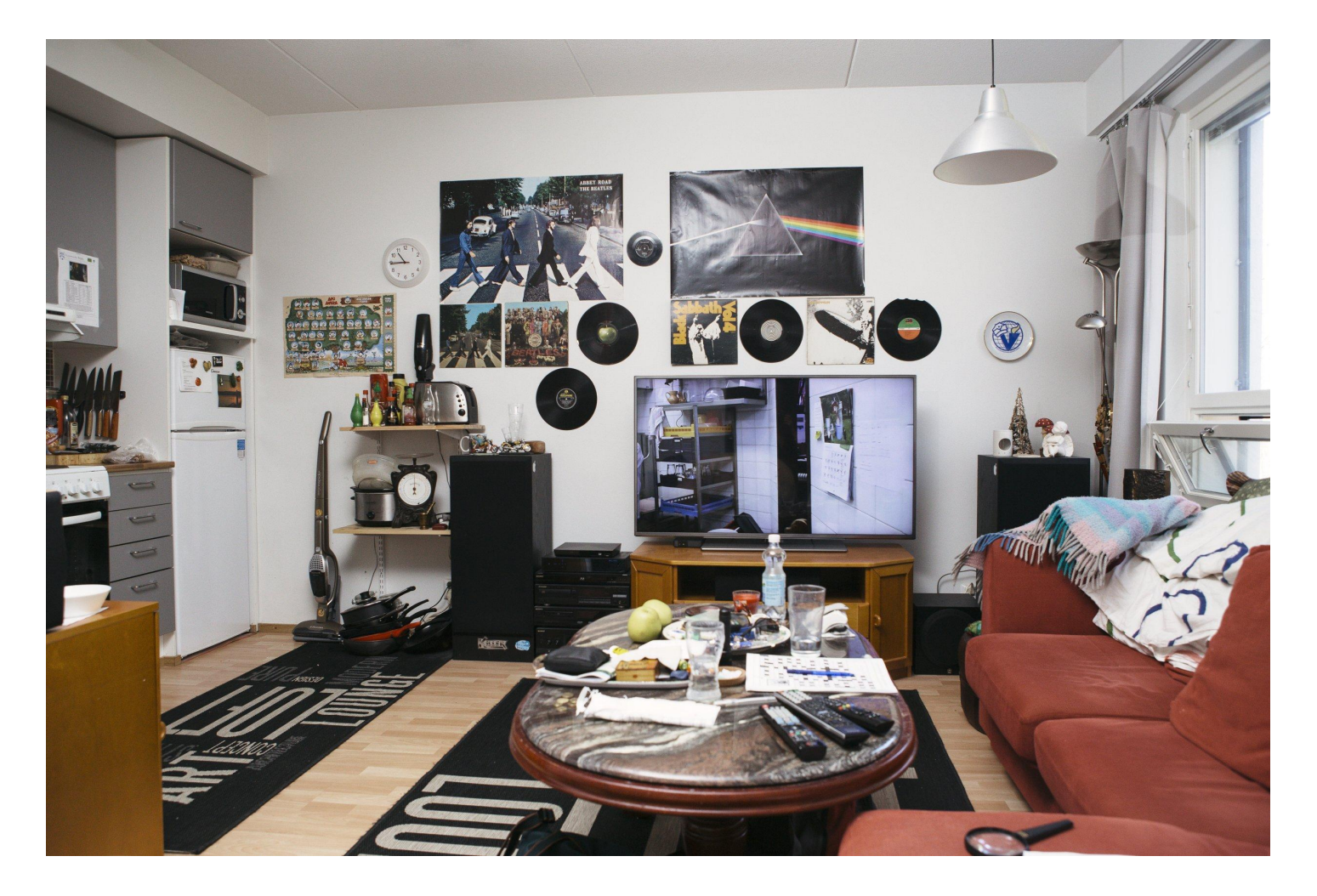
An apartment in Väinölä, a social housing development for formerly unhoused people in Espoo, Finland.