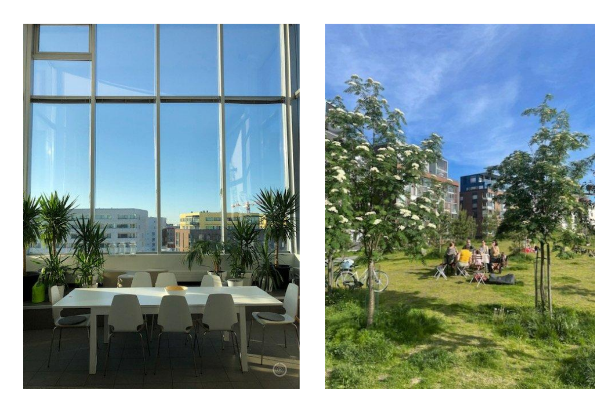
Communal spaces in the social housing project where Vesala lives.

"In the last month I have had some neighbor bringing me flowers, chocolate, fresh orange juice. One is currently knitting some winter hats for me. And we have a really gorgeous communal space in the building, it is called a winter garden... And free laundry room. Of course we have two saunas in the building, next to the winter garden upstairs. It costs 12 Euros [$13] monthly to have your own weekly sauna for an hour.